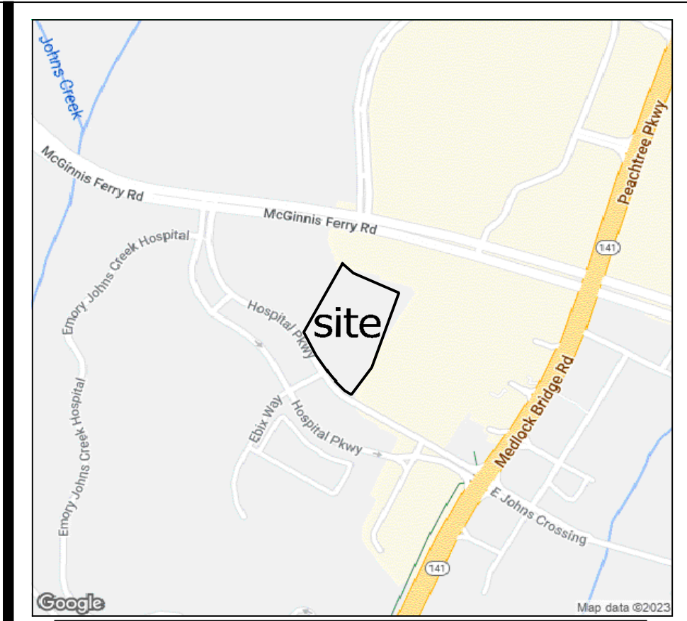
VICINITY MAP not to scale

PER SEC. 12E.3.A.2, 50% OF REQUIRED OPEN SPACE MUST BE ONE CONTIGUOUS AREA, OR ONLY SEPARATED BY A RESIDENTIAL STREET. ALL OPEN SPACE AREAS ARE CONNECTED BY SIDEWALKS AND/OR MULTI-USE PATHS AND ARE ONLY SEPARATED BY THE RESIDENTIAL STREET, CONSISTING OF OVER 100% OF THE REQUIRED COMMON OPEN SPACE.