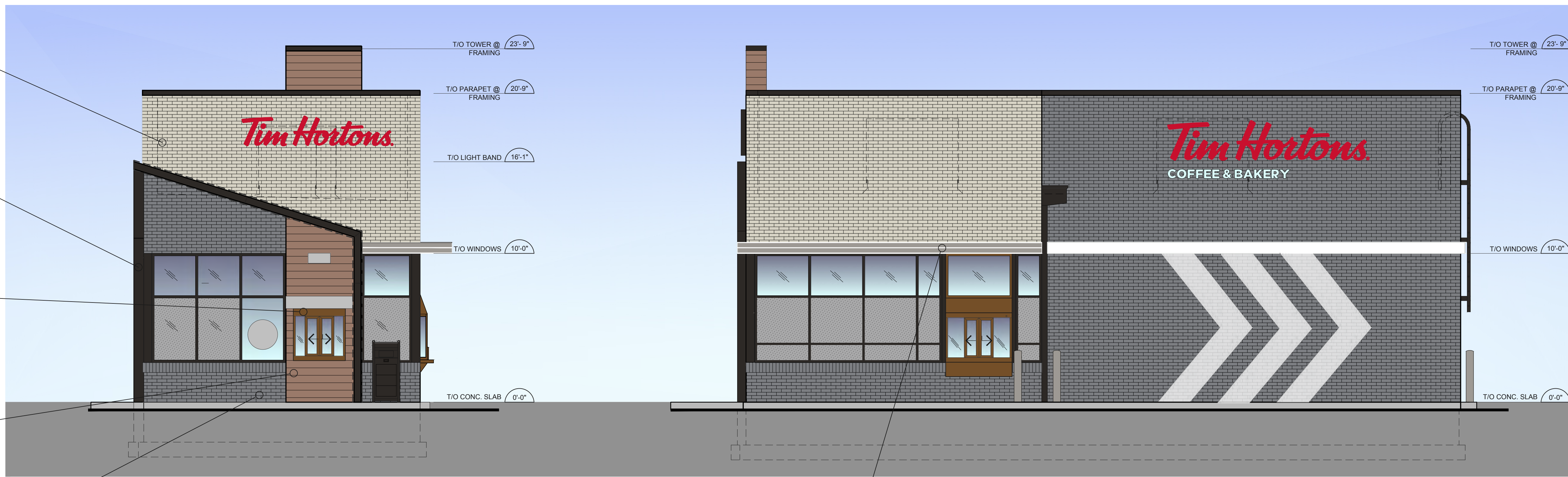
1 FRONT ELEVATION A5 SCALE: 1/4"=1' - 0"