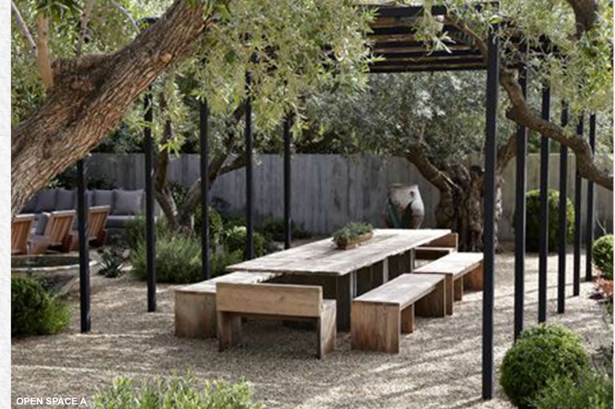
OPEN SPACE A