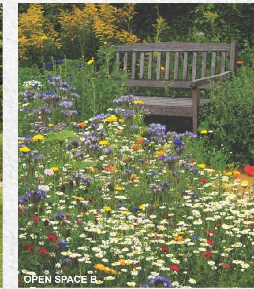
OPEN SPACE B