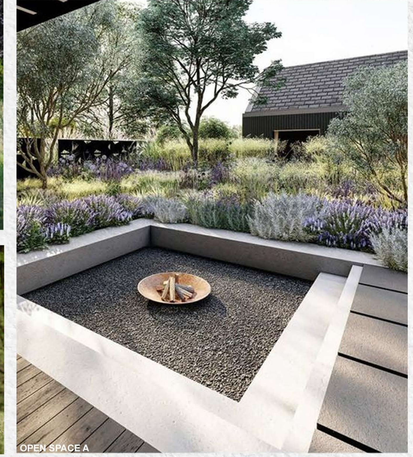
OPEN SPACE A