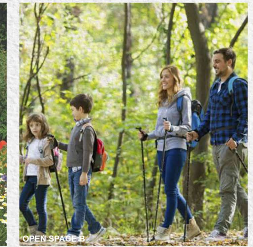
OPEN SPACE B