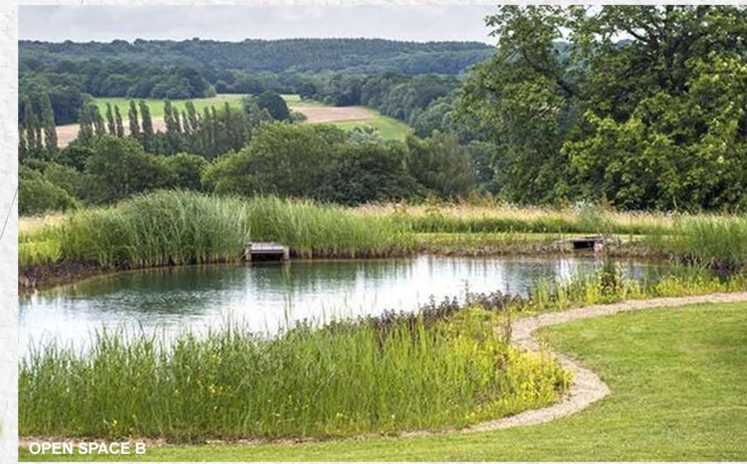
OPEN SPACE B

Received February 27, 2024 RZ-24-0002 Planning & Zoning