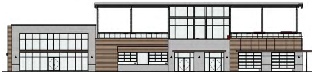
Building C - Front Elevation