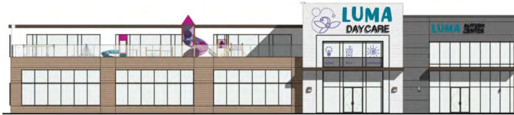
Building B - Right Elevation