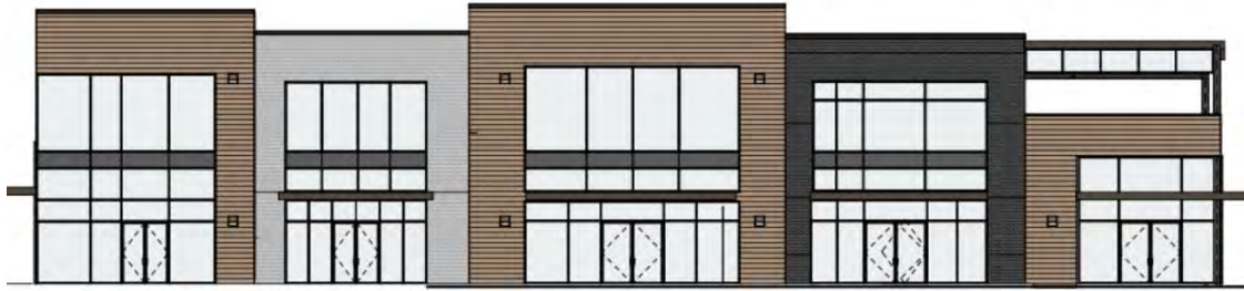
Building D - Front Elevation – View from McGinnis Ferry Road