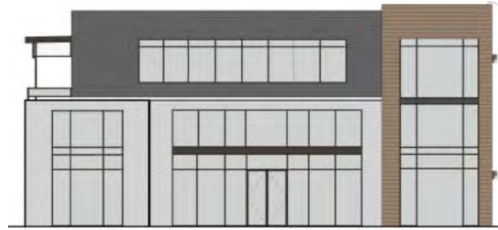
Building D - Left Elevation