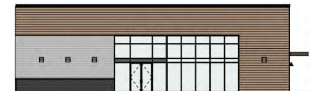
Building C - Left Elevation