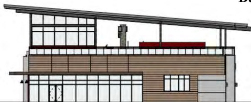
Building C - Right Elevation - View from Existing Trail