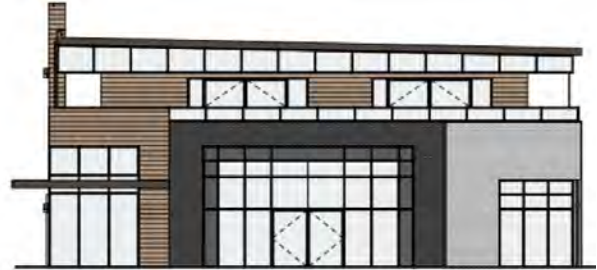
Building D - Right Elevation