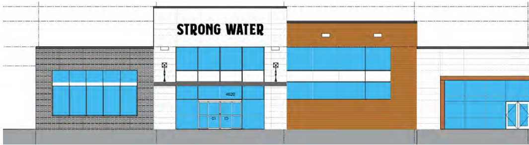
Building A - Front Elevation

The submitted elevations for all four commercial buildings indicate the building façade would be constructed primarily of brick veneer, aluminum composite material (ACM) panels (varied finishes) and glass. The proposed exterior building materials, colors, varied heights, recess, and architectural elements provide for considerable variations in the building façade. The proposed 2-story buildings with a rooftop patio are a maximum of 44 feet in height and would be compliant with the maximum building height permitted in the C-1 Zoning District and Town Center Overlay. Staff would note that all proposed commercial buildings must comply with Section 12A.3.9. (Building Type) and Section 12A.3.10. (Building Design) requirements of the Town Center Code prior to issuance of building permits.