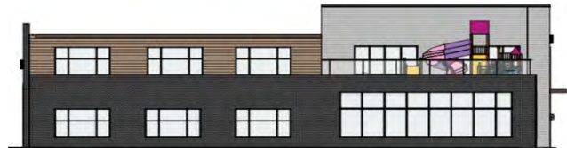
Building B - Left Elevation