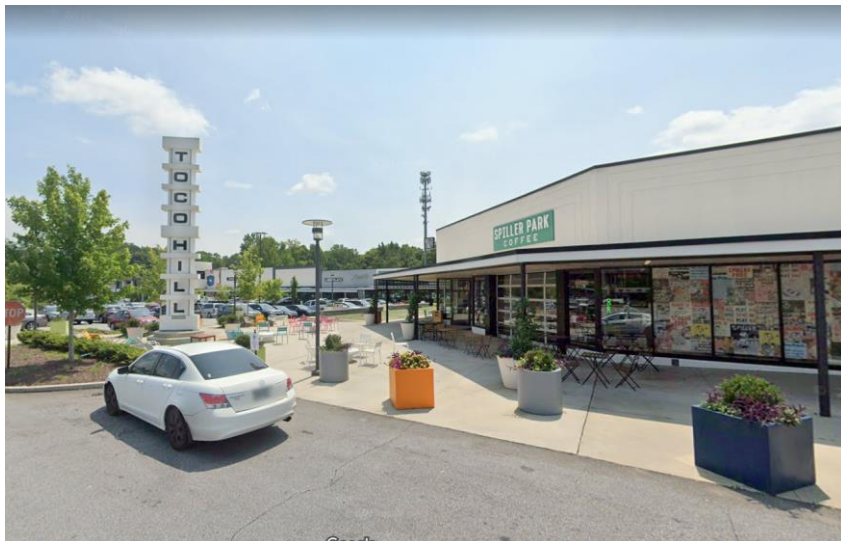
Upgraded Retail with Placemaking