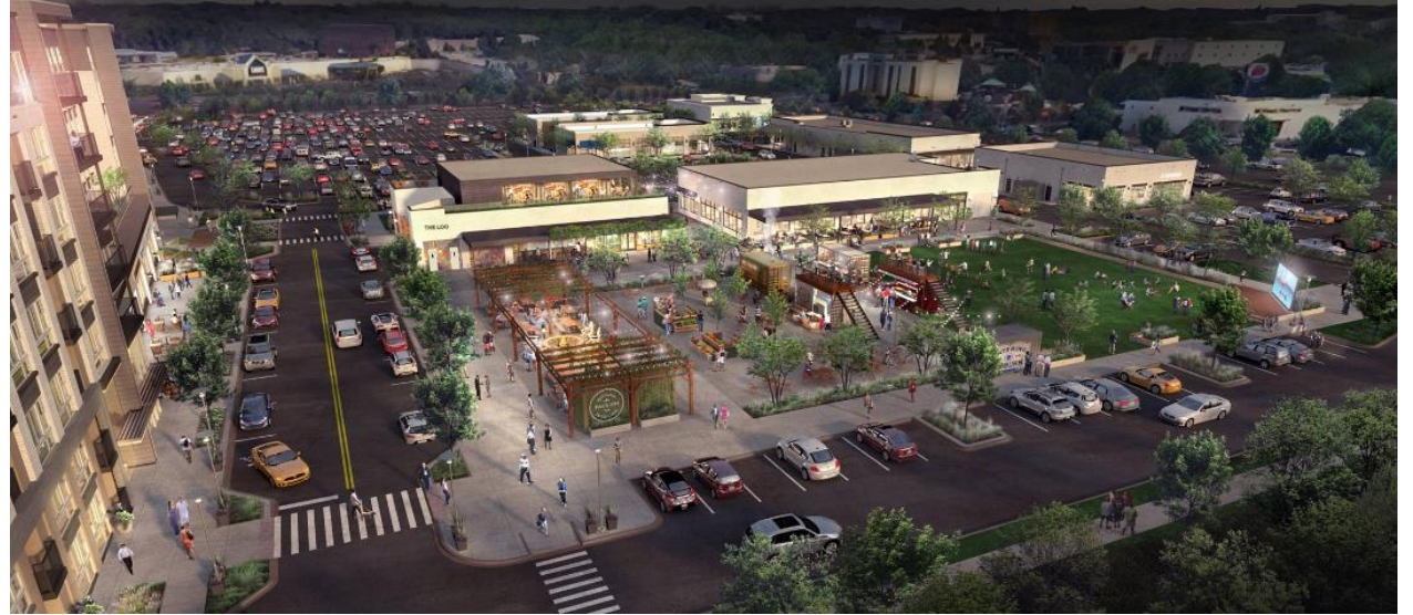
Mixed-use Infill with Traditional Retail