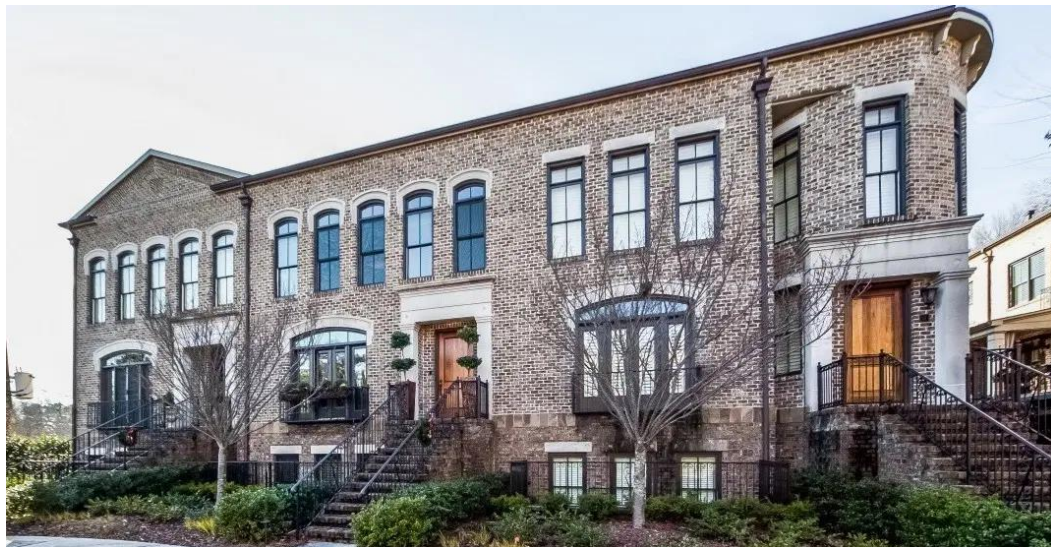
Townhome or Stacked Flat