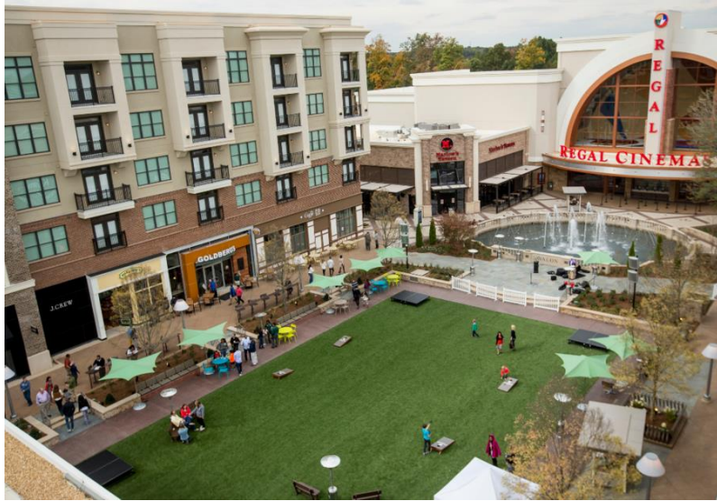
Mixed-use with Pedestrian-only Green