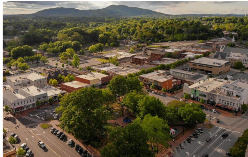
Mixed-use on Town Square with Auto Access on all sides