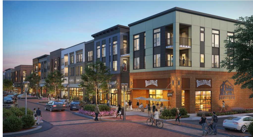
Housing above retail