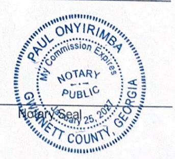
Signature of Notary Public