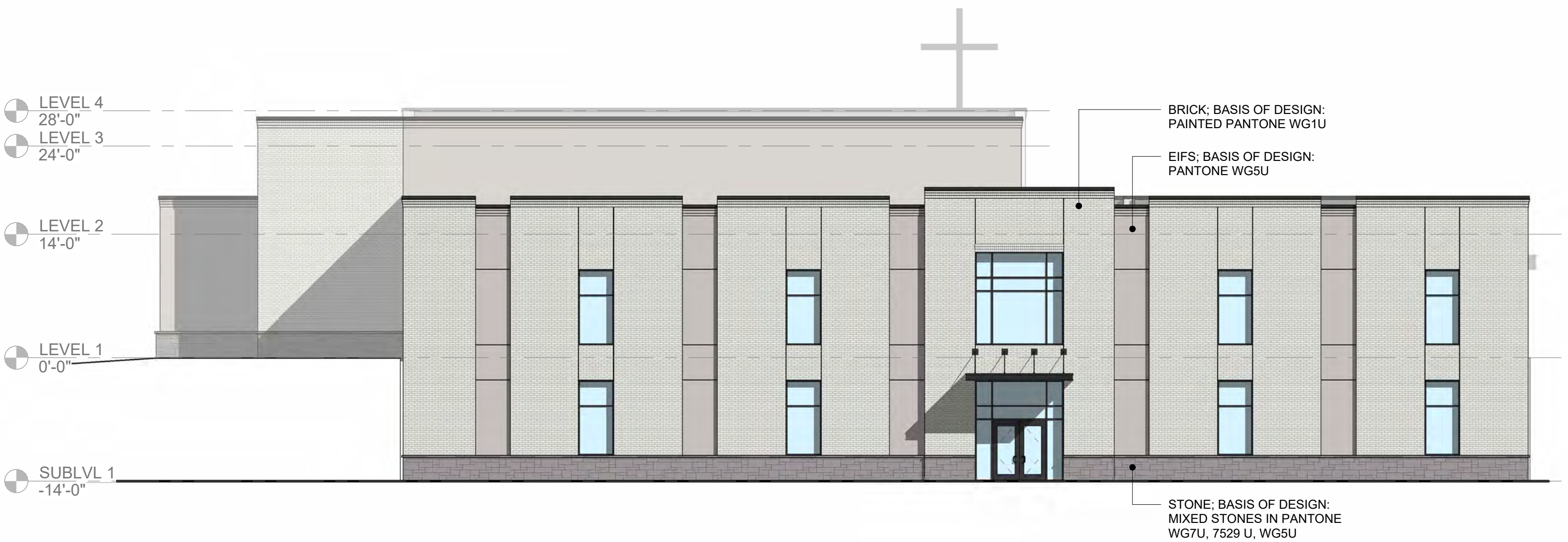
3 SOUTH ELEVATION 3/32" = 1'-0"