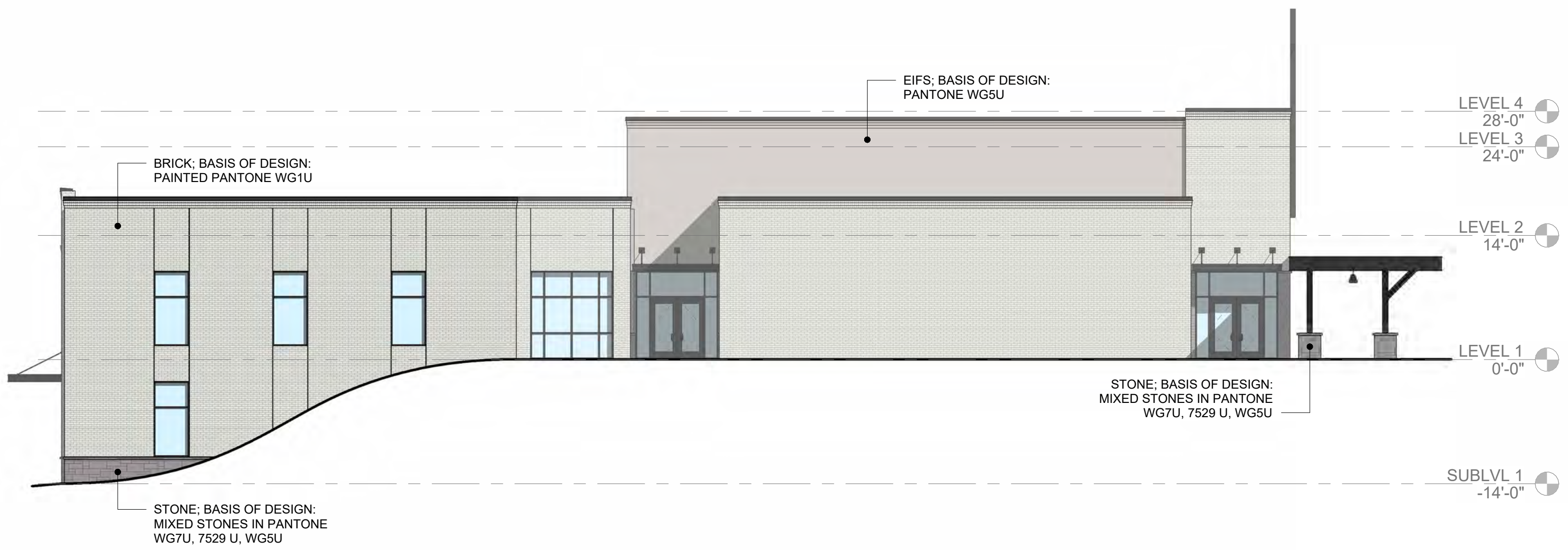
2 EAST ELEVATION 3/32" = 1'-0"